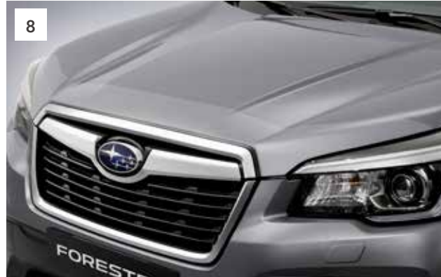
8 Bonnet Protection Foil SEZNSJ2100

Improved wiping performance even under severe conditions and at high speed. *Front: set of 2.