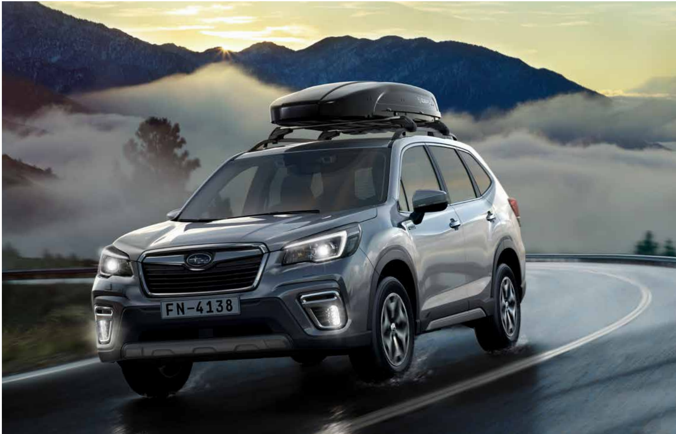
P2: Aluminium Carrier Base, Roof Box