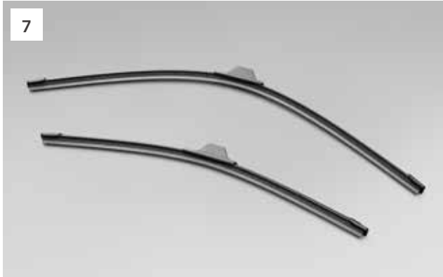
7 Wiper Blade Flat Front / Rear SETRSJ8000 / SETRYA8000

Improved wiping performance even under severe conditions and at high speed. *Front: set of 2.