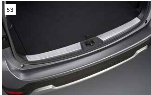
53 Cargo Room Plate, Resin SEAESJ1000

Transparent film to protect the upper surface of the bumper from scratches.