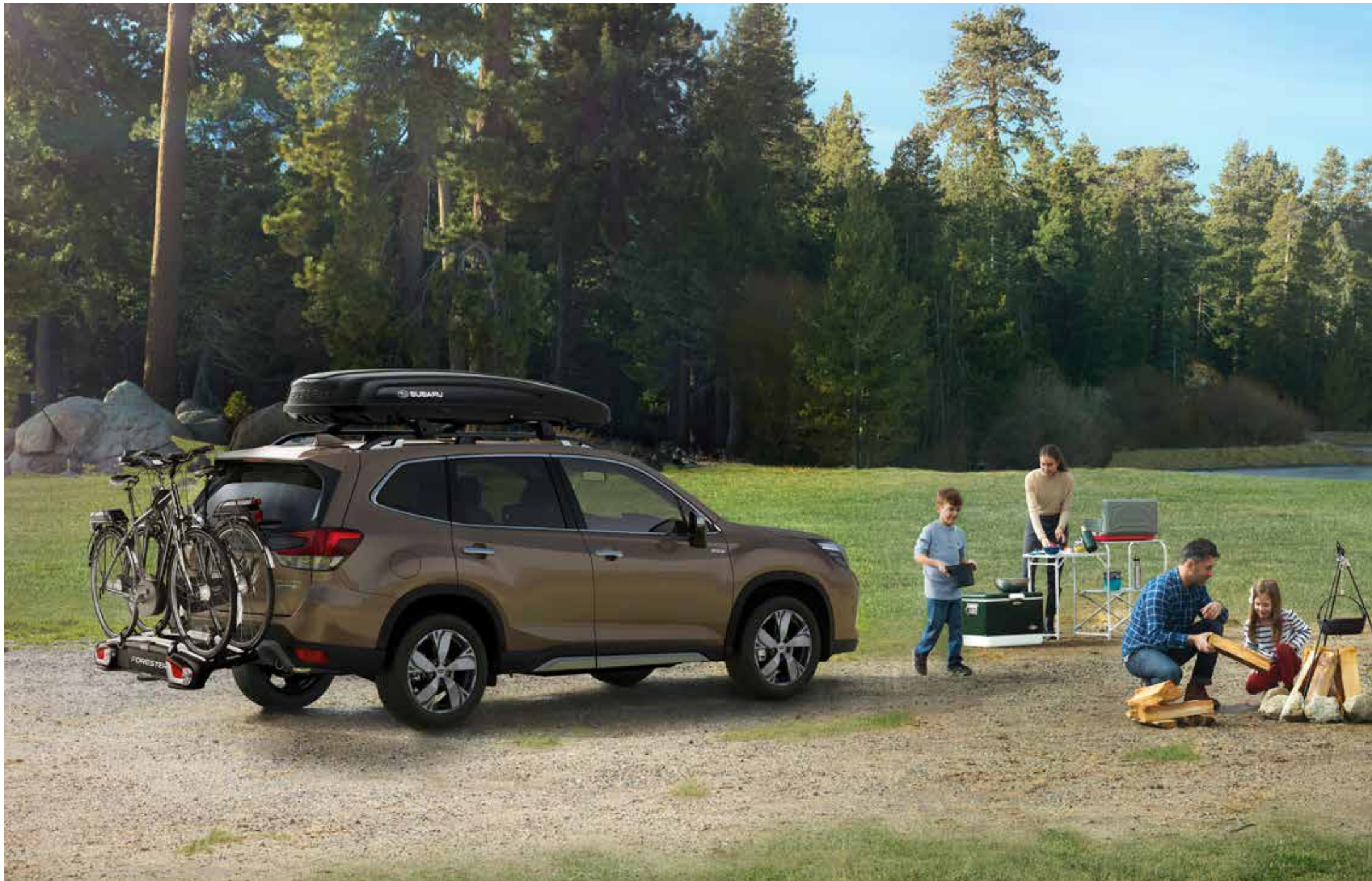
P8: Aluminium Carrier Base, Roof Box, Trailer Hitch, Rear Bike Carrier