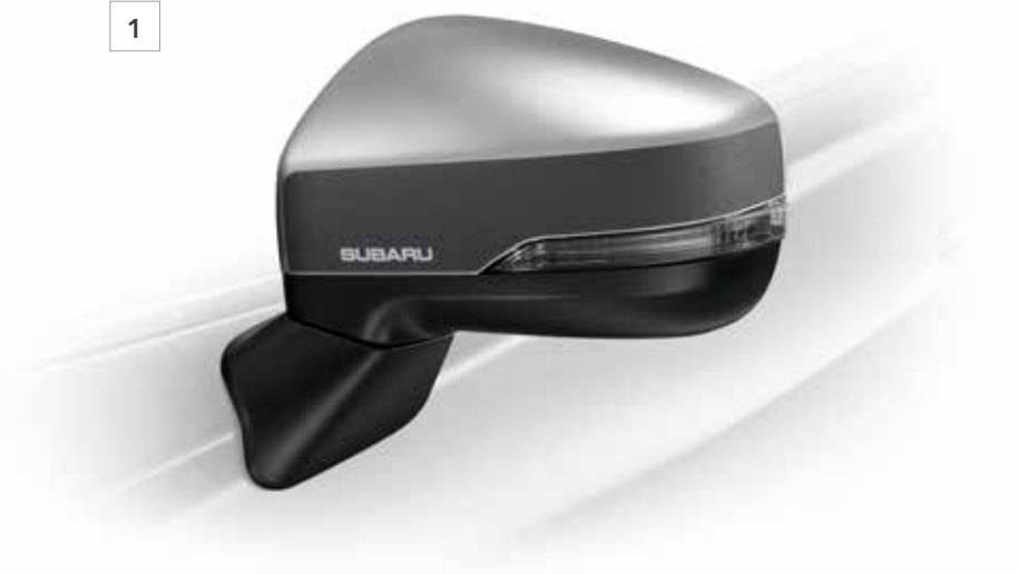
1 Wing Mirror Foil Black SEZNFL3100

Gives a whole new look to the side wing mirrors.