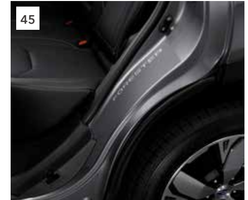
45 Rear Entry Protection Foil SEZNSJ3100

Elegant stainless-steel sill plate equipped with a Subaru logo. *Front set.