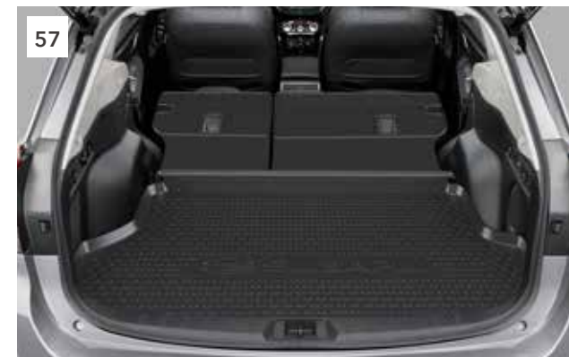
57 Rear Seat Back Protector J501ESJ200

Protects luggage space floor from dust and dirt.