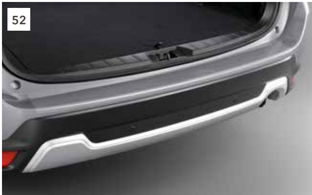
52 Cargo Step Protection Foil SEZNSJ2000

Cover in stainless steel protects the rear bumper from scratches.