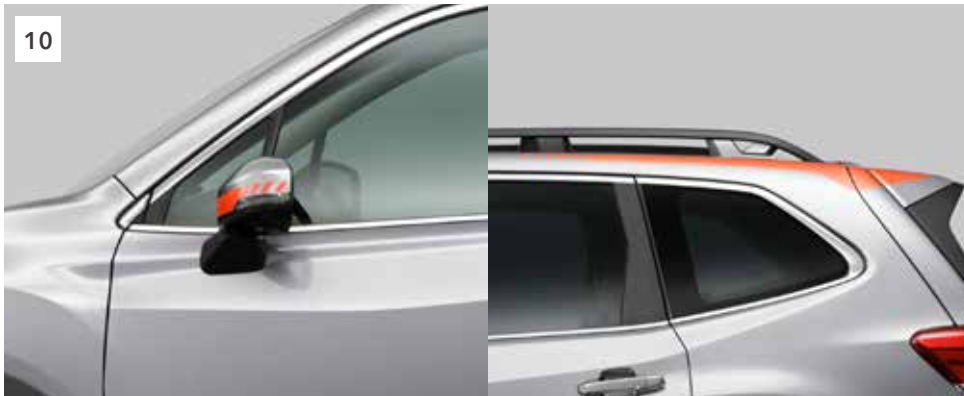
10 Orange Touch Foil SEZNSJ4000

Transparent foil that protects the door handle area from scratches. *Set of 2.