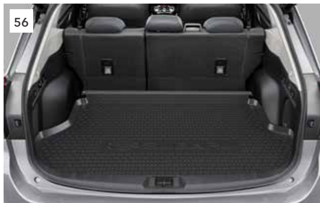
56 Cargo Tray Low J501ESJ000

Extra protection for the luggage space. Suitable for fishing and hunting.