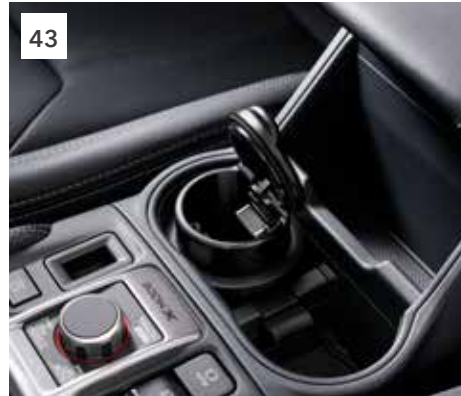
43 Ash Tray F6010AG000

Changes the accessory socket to a cigarette lighter.