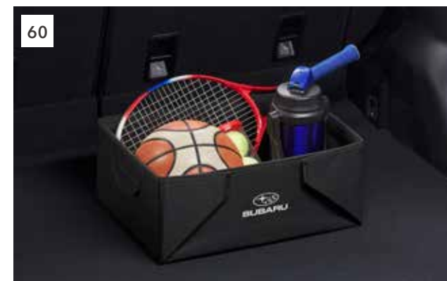
60 Cargo Management Box SECMYA1000

Neatly holds cargo and prevents it from sliding while the vehicle is in motion. Stowable in PVC leather bag.