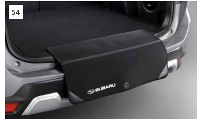
54 Boot Flap E101EAJ500

Rugged plastic resin cover in brushed aluminium finishing helps protect the cargo entry panel.