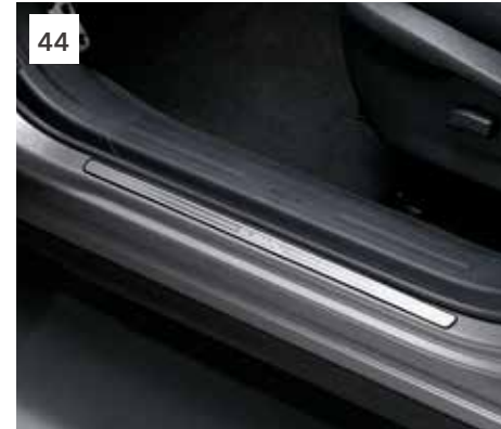
44 Side Sill Plate Stainless E1010SJ010

Interchangeable ash tray fits into the centre console cup holder