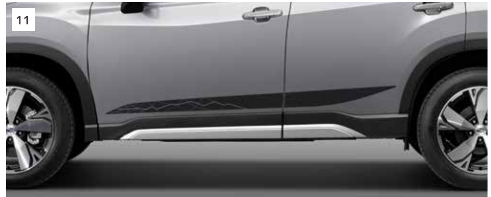
11 Side Decoration Foil SEZNSJ3000

Gives a colourful touch to the exterior.