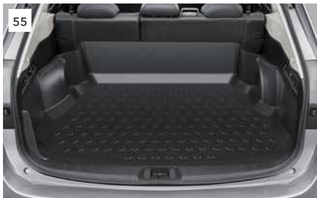
55 Cargo Tray Deep J501ESJ100

Extra protection for the luggage space. Suitable for fishing and hunting.