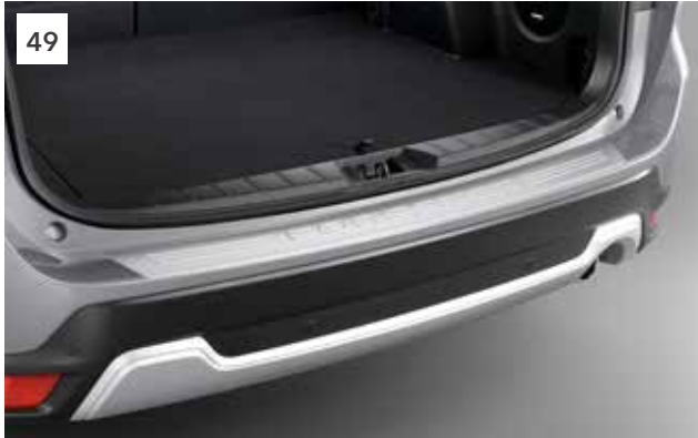
49 Cargo Step Panel (Resin Alu Brushed) E771ESJ010

Rugged plastic resin cover in brushed aluminium finishing helps protect the upper surface of the bumper.