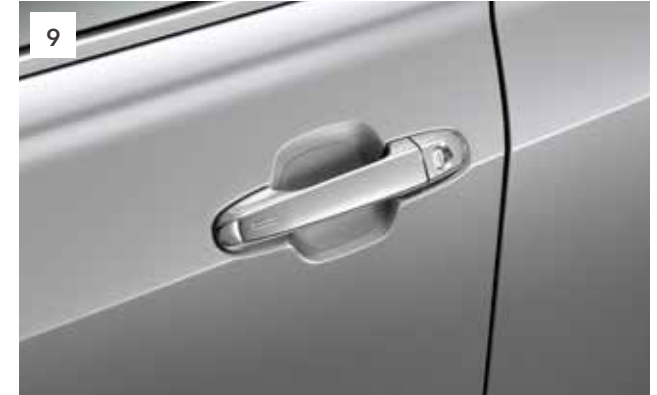
9 Door Handle Protection Foil SEZNF22001

Transparent foil that protects the upper part of the bonnet from scratches and stone chips.