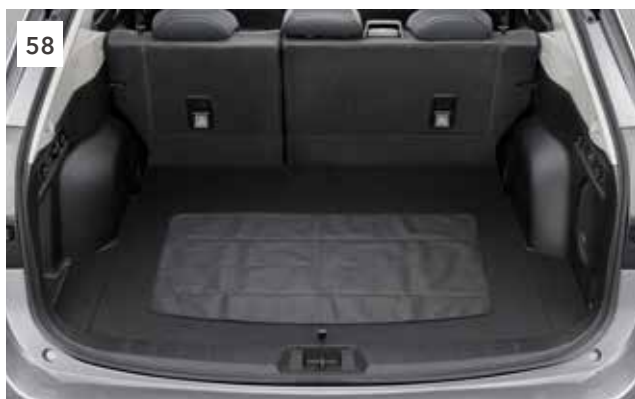
58 Anti-slip Mat SENYA1000

Protects back of rear seats from dust and dirt. *In combination with Cargo Tray Low.