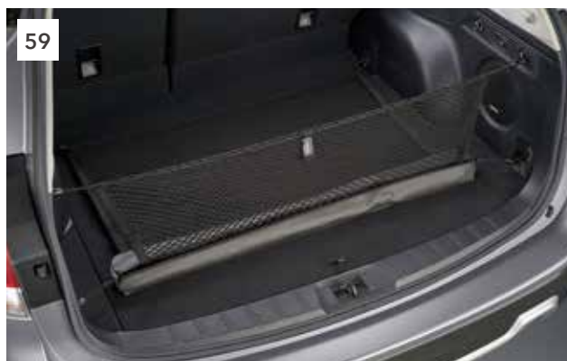
59 Cargo Net Rear F551SSJ000

Mat made of anti-slip material that will prevent luggage from moving around in the cargo area.